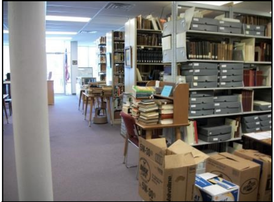
Before: Obviously we needed more shelf space.

Thank you for your support during this transformation. We look forward to sharing our future accomplishments with you. ■