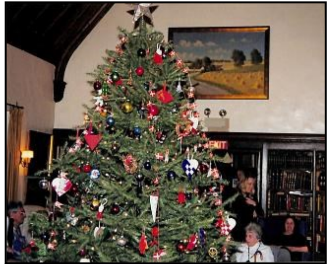
Christmas in the library.