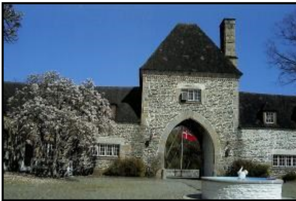
Main building entrance, courtyard and fountain at Croton-on-Hudson.

The Danish Home opened to residents in December of 1906.