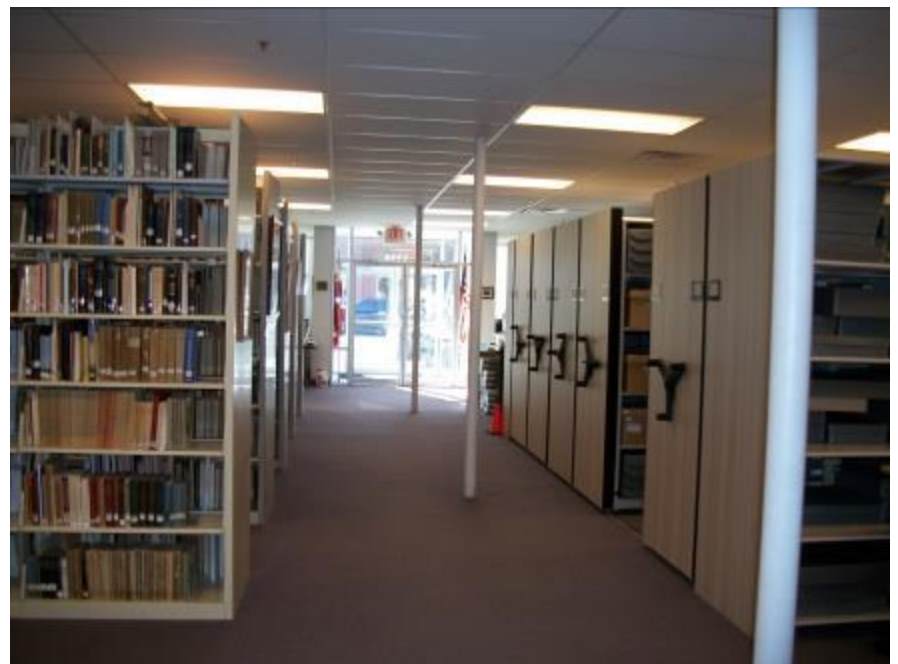
After: So much better! Room to spare.