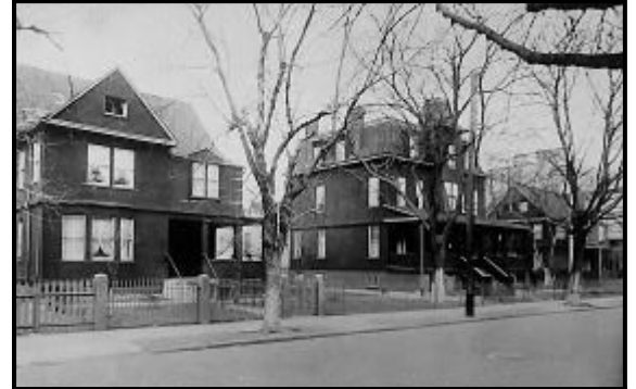
Houses of the Danish Home in Brooklyn.