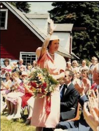
HRH Princess Benedikte of Denmark at Grundlovsdag in 1988.

Danes opened and operated many of what used to be called "old people's homes," and the DAAL has material from a dozen such places. We are pleased to have been entrusted with preserving the records of the Danish Home in Croton-on-Hudson, New York. The Home's goal of providing high quality care to retirees in an atmosphere of Danish hospitality and tradition is an